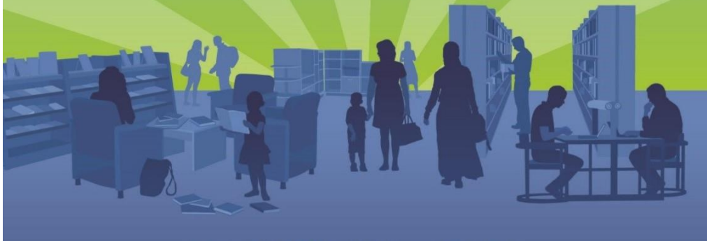
Table Captain Toolkit